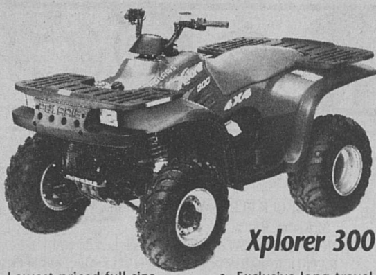
Xplorer 300 4x4